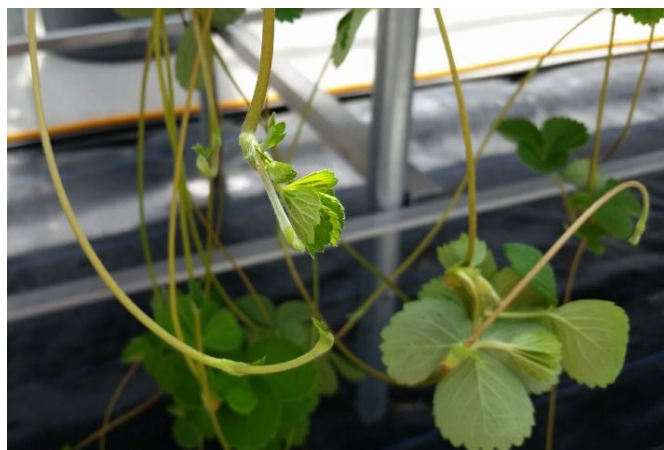
Figure 1. Strawberry runners used for meristem culture.

temperatures in the greenhouse during the summer are favorable for reducing virus replication in the meristems.