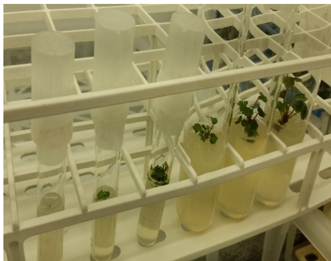
Figure 3. Strawberry in-vitro plants, from meristem (left) to fully developed plantlet (right).

Shoots that test negative for bacteria and fungi are divided, and clumps of plantlets are sub-cultured into rooting medium where they grow taller and form roots before they are taken out of in-vitro conditions (Fig. 3).