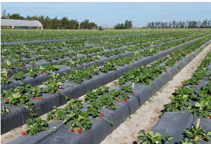
Figure 5. A verification trial at UF/IFAS GCREC.

Meristem plants are propagated via runners and placed in fruiting verification trials (Fig. 5) at GCREC, where performance is evaluated for multiple years. The strawberry breeder and the breeding staff regularly monitor the trials to observe any diseases or other visual problems. DNA markers are employed along with visual observations to confirm that the plants are true-to-type, meaning that there are no mix-ups or mislabeling of cultivars. Only the meristem sources without defects are released to nurseries for further multiplication.