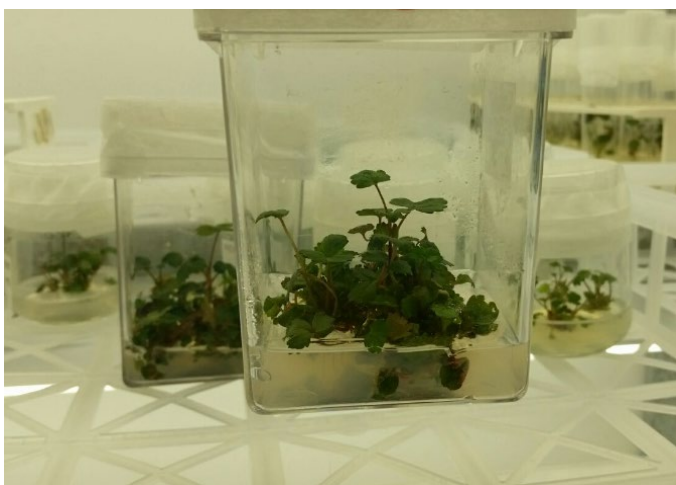
Figure 2. Strawberry shoots during multiplication.

During multiplication, shoots are transferred into fresh media every four weeks (Fig. 3). They are also tested for bacteria and fungi using four different types of media that provide the right conditions for their growth. The number of subcultures during multiplication are limited to 10 to reduce the risk of somaclonal variation which can produce off-types.