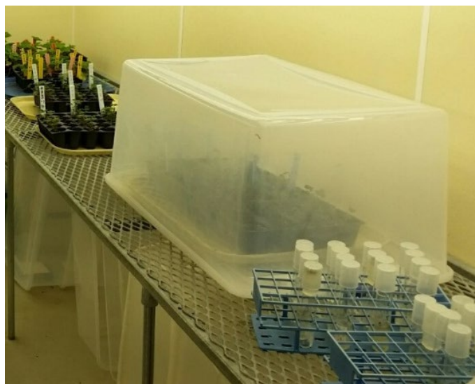
Figure 4. Acclimatization of meristem plants, from test tubes to plants in soilless media.

Rooted plants in test tubes are placed in a growth room in cell trays filled with soilless peat-based media inside a humid chamber (Fig. 6). These plantlets need to be slowly acclimatized for a successful transition from in-vitro to ambient conditions. The plants develop in the growth room for a minimum of 8 weeks before virus testing procedures begin.